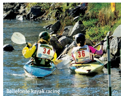
Bellefonte kayak racing