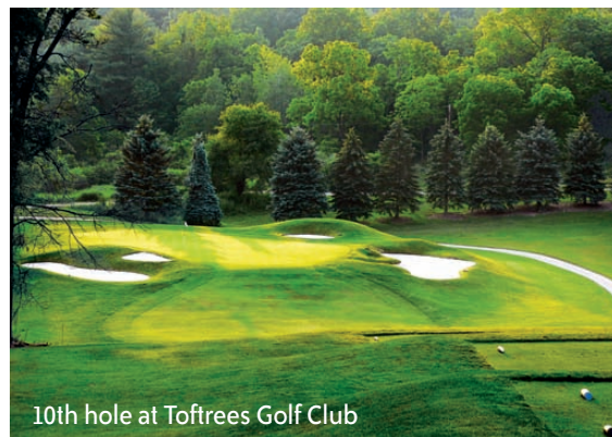
10th hole at Toftrees Golf Club

Designed by renowned golf course architect, Ed Ault, Toftrees has recently been rated 4 1/2 stars by Golf Digest's "Places to Play." For further course information, call 814-238-7600 or visit www.toftreesgolf.com .