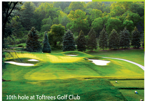
10th hole at Toftrees Golf Club

LOCATION: Toftrees Golf Club —One Country Club Lane. Designed by nationally renowned golf course architect, Ed Ault, Toftrees has recently been rated 4 1/2 stars by Golf Digest's "Places to Play." For further course information, call 814-238-7600 or visit www.toftreesgolf.com .